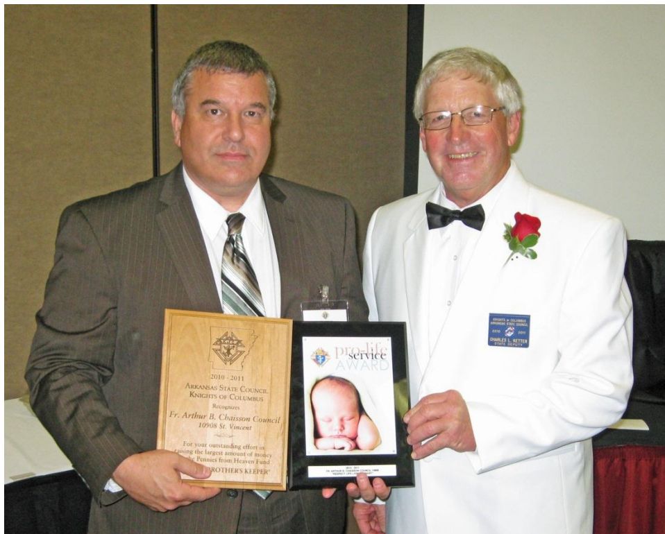
PRO- LIFE: "RESPECT LIFE LIVING ROSARY" Council 10908 Saint Vincent

This council hosts a Memorial Mass and dinner to celebrate the lives of their deceased brother Knights and to let the widows of those Knights do not know they nor their husbands are forgotten.