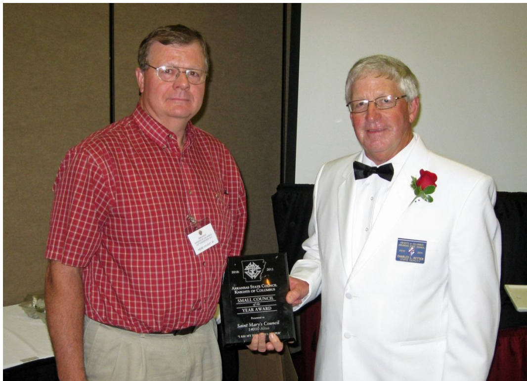
SMALL COUNCIL OF THE YEAR