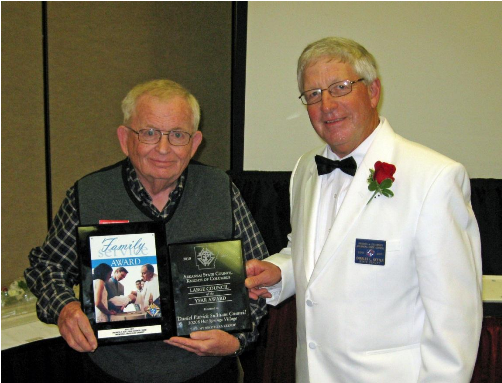
FAMILY: "MEMORIAL MASS AND DINNER" Council 10208 Hot Springs Village

This council hosts a Memorial Mass and dinner to celebrate the lives of their deceased brother Knights and to let the widows of those Knights do not know they nor their husbands are forgotten.