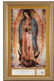
2011-13 Our Lady of Guadalupe