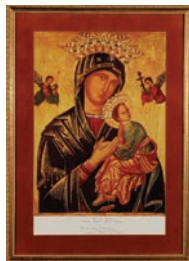
1984-85 Our Lady of Perpetual Help