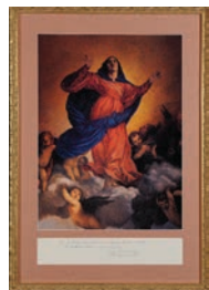
1990-91 Our Lady of the Assumption