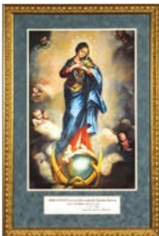
2013-14 Immaculate Conception