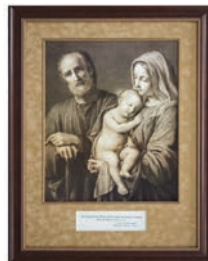
2015-16 Holy Family