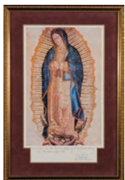
1995-96 Our Lady of Guadalupe