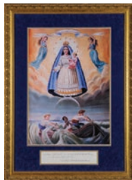
2007-08 Our Lady of Charity