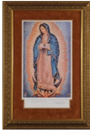
2000-01 Our Lady of Guadalupe