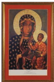
1986-87 Our Lady of Czestochowa