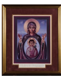
1997-98 Our Lady of the New Advent