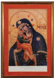
1988-89 Our Lady of Pochaiv