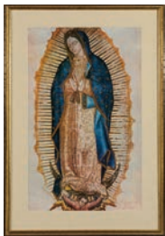
1979-80 Our Lady of Guadalupe