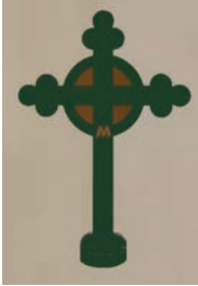
1999-2000 Millennium Cross