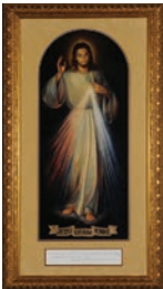
2003-04 Divine Mercy