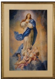
1981-82 Immaculate Conception