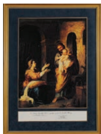
1993-94 Holy Family