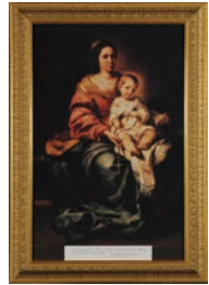
2002-03 Our Lady of the Rosary