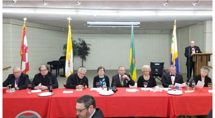
Banquet head table