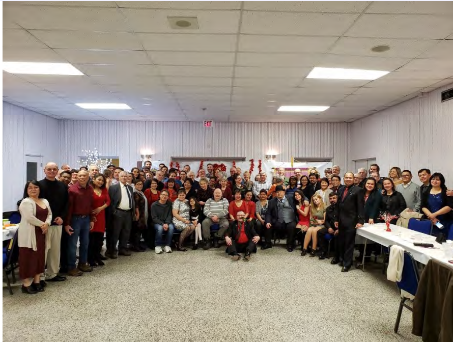
Council 4704 Saint Valentine's party, Feb 9 2019