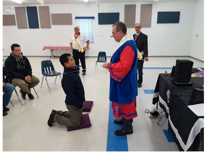
Formation and Knighting Degree in Meadow Lake on Jan. 27th, 2019