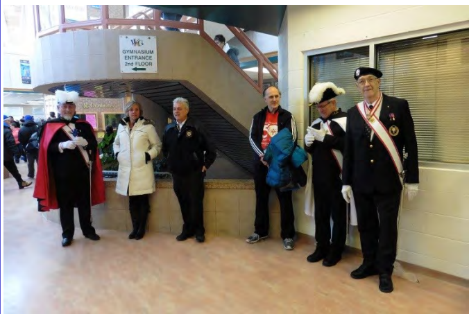
Fr. Hugonard Assembly colour guard at Special Olympics Saskatchewan Winter Games opening ceremonies