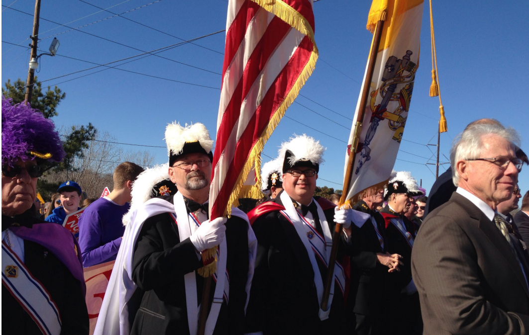
Pictured Above March for Life Color Guard