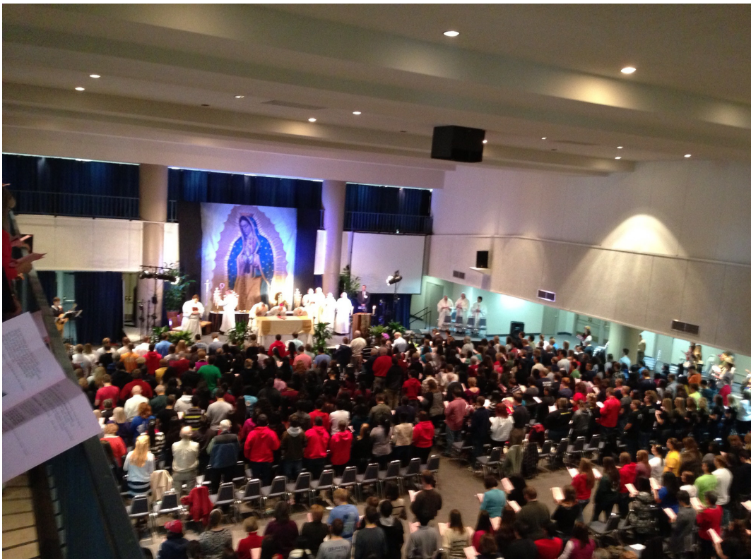
Pictured Above Mass for Life