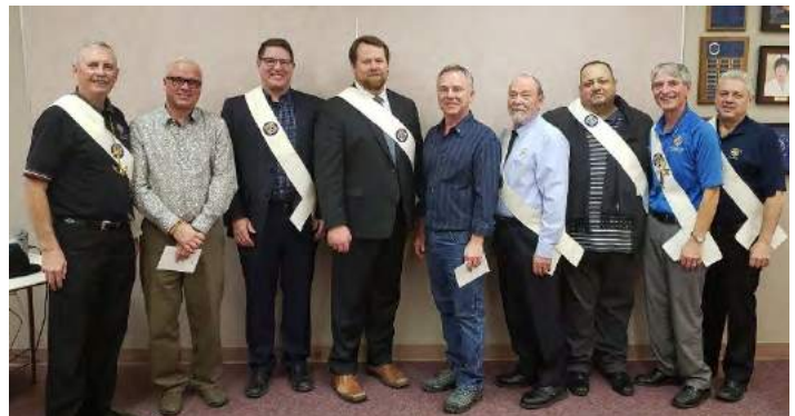
Admission Degree at St. Martin in Regina on December 20th