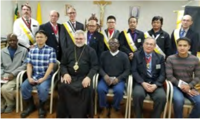
Council 1517 held an Admission Degree in Saskatoon on December 9th with 4 new members.