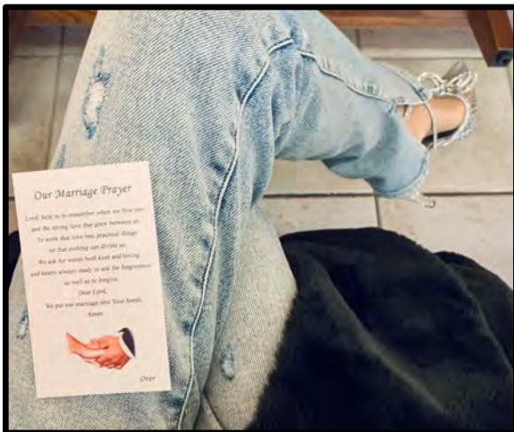
Our Marriage Prayer Celebration