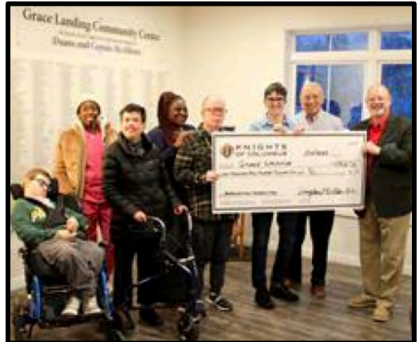
Brookfield Knights Give Back

St. Katharine Drexel School in Beaver Dam recognized the winners of the Knights of Columbus Knowledge Contest for Spelling and Math . The school expressed its gratitude to Beaver Dam Knights of Columbus Council 1837.