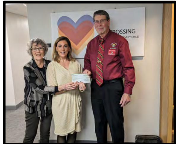
ASAP Check Delivery

The Menasha Knights of Columbus Council 1838 are leading the way by creating the first "Vinnies Crew" from their local parishes and knights, who are selflessly volunteering at Vinnies Pantry in Neenah. Their unwavering commitment to serving their community is truly inspiring. We express gratitude for their efforts and look forward to seeing more of their positive impact in the future.