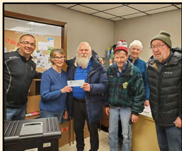
Long Time Support

During Marriage Prayer Week, the De Pere Council 3955 celebrated the sacred bond between a husband, wife, and God. It is through this bond that a strong family foundation is built, and together, they can overcome any challenge. The Knights of Columbus encourages families to take time each day to pray together, strengthening their love and commitment to one another.