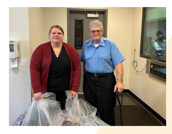
Coats for Kids - Green Bay

Working together with the Green Bay Police Department, Msgr. Basche Council 4505 of the Knights of Columbus provided warmth and hope to children in need by distributing 42 coats as part of the Coats for Kids drive.