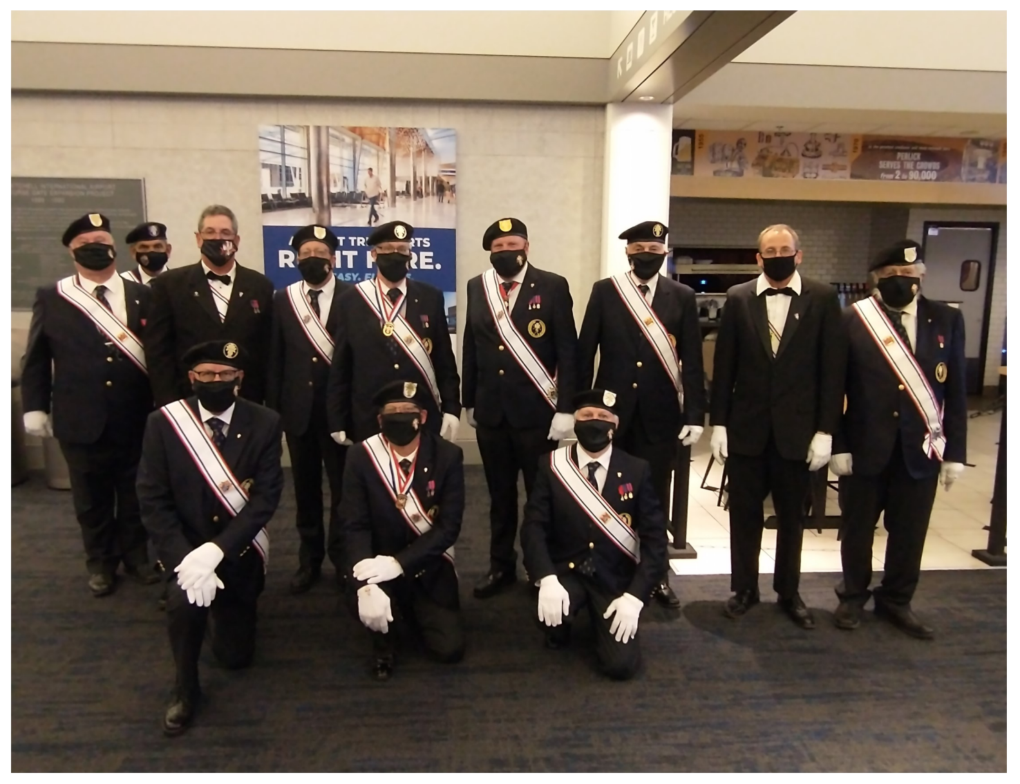
Knights of Columbus Fourth Degree Honor Guard members help welcome returning veterans at the Milwaukee Stars and Stripes event on September 25th