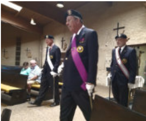
Transfer of the Silver Rose from Wisconsin to Illinois at St. John the Evangelist Catholic Church in Twin Lakes Wisconsin.