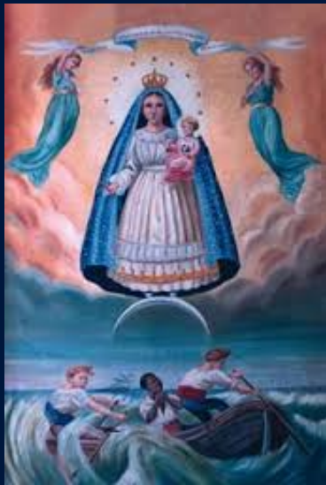
Our Lady of Charity