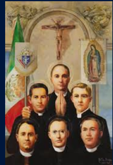
The Mexican Martyrs

Total State Membership as of July 30, 2015: 7500(+16)