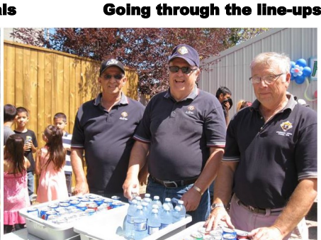
Having fun & looking good too!!