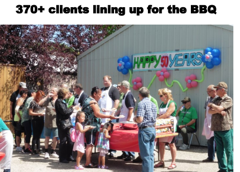
Knights & friends serving up a tasty meal