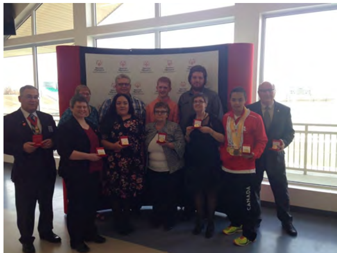
There were 9 medals in all presented in Saskatchewan.