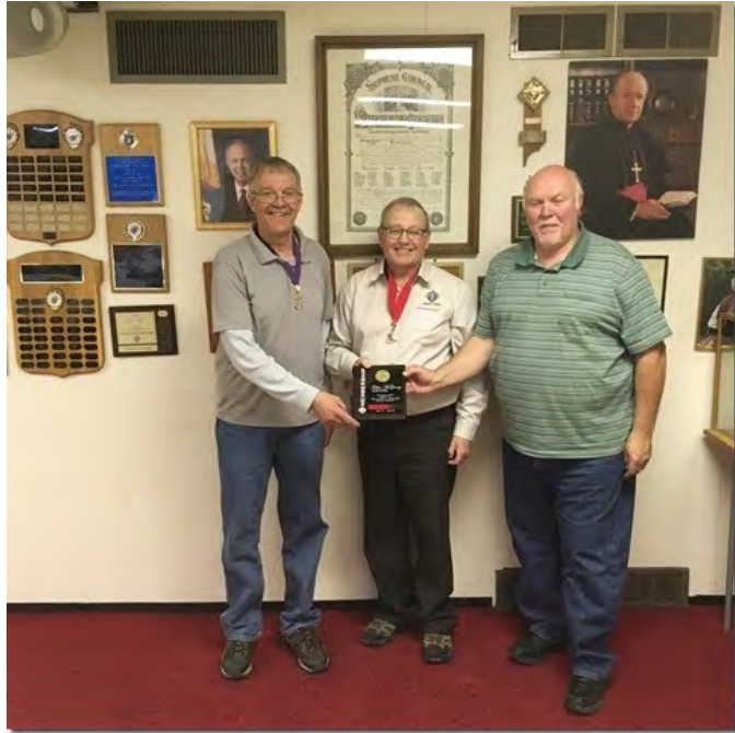
2017-18 Fr. McGivney Membership Award