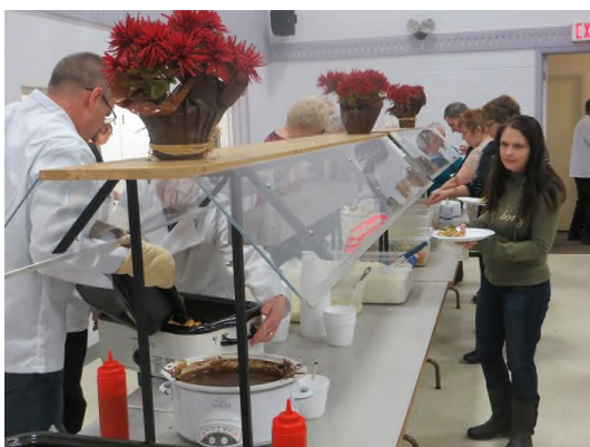
St. Joseph Council 7336 11th Annual Fish Fry.

I will attempt to get more detailed information for you on these two initiatives.