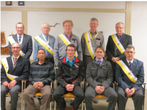
1st Degree in Unity and Swift Current

When planning your annual Youth Program, consider including activities to support a Catholic summer camp in your area. Support them in their fundraising efforts. Ask them if they need volunteer assistance for fundraising projects or preparing the camp for the next season. Talk to your parish priest to determine if some local youths in need might benefit from a sponsorship to attend a camp session. It's a wonderful way to provide our youth with healthy exercise in a setting where our faith is celebrated.