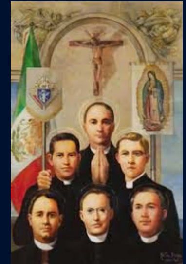
The Mexican Martyrs