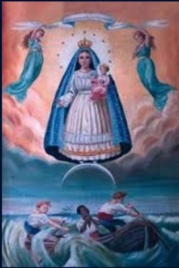
Our Lady of Charity