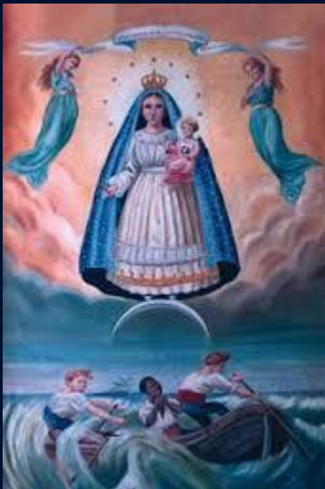
Our Lady of Charity