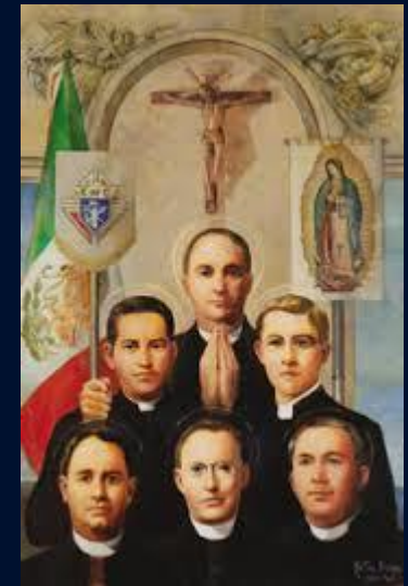
The Mexican Martyrs