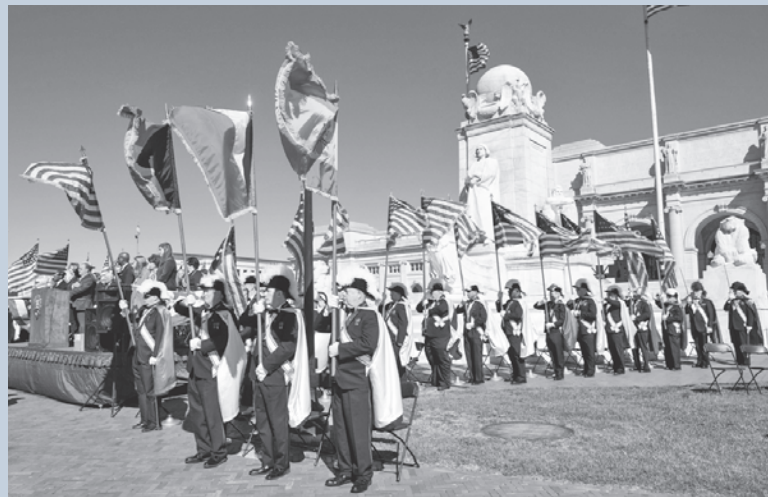
A Knights of Columbus honor guard stands in front of the Christopher Columbus Memorial Fountain in Washington, D.C., during ceremonies on Columbus Day 2016. The project to build the Columbus memorial was sponsored by the Knights of Columbus in 1906, when the Order was less than 25 years old. Although the Order had only 143,000 members at the time, the Knights successfully lobbied Congress to build the monument. It was unveiled six years later, in 1912.