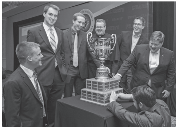
Members of Council 1477 of the University of Notre Dame smile as an engraving containing their council’s name is added to the Outstanding College Council Award.

“Pope Francis warned us that we will lose our religious freedoms if young people, such as ourselves, remain silent on the sidelines,” he shared. “Therefore, we must ensure that our Knights councils continue to be an active presence on our campuses and in society at large.”