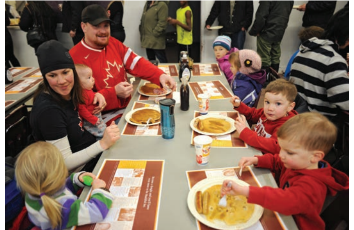
A family participates in a council-organized pancake breakfast — a popular Mardi Gras activity. Similar family breakfasts, suppers and Fish Frys are among the most popular K of C Mardi Gras and Lenten activities.