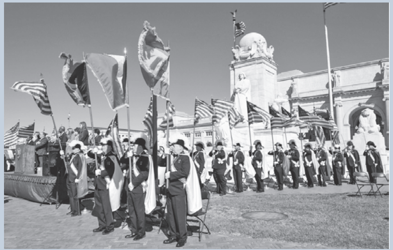
A Knights of Columbus honor guard stands in front of the Christopher Columbus Memorial Fountain in Washington, D.C., during ceremonies on Columbus Day 2016. The project to build the Columbus memorial was sponsored by the Knights of Columbus in 1906, when the Order was less than 25 years old. Although the Order had only 143,000 members at the time, the Knights successfully lobbied Congress to build the monument. It was unveiled six years later, in 1912.