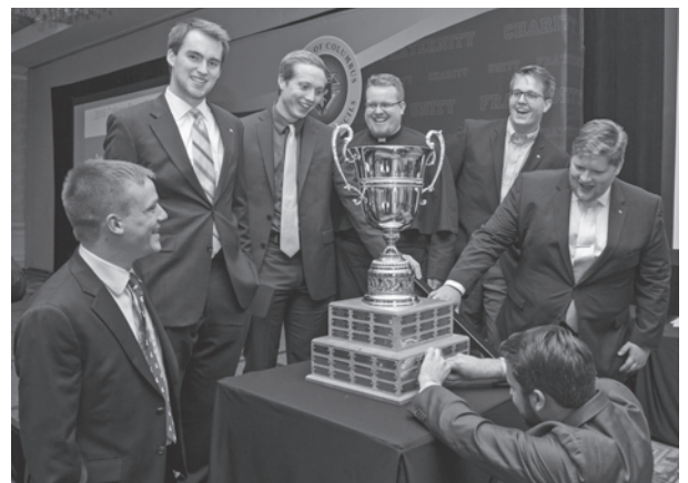
Members of Council 1477 of the University of Notre Dame smile as an engraving containing their council’s name is added to the Outstanding College Council Award.

“Pope Francis warned us that we will lose our religious freedoms if young people, such as ourselves, remain silent on the sidelines,” he shared. “Therefore, we must ensure that our Knights councils continue to be an active presence on our campuses and in society at large.”