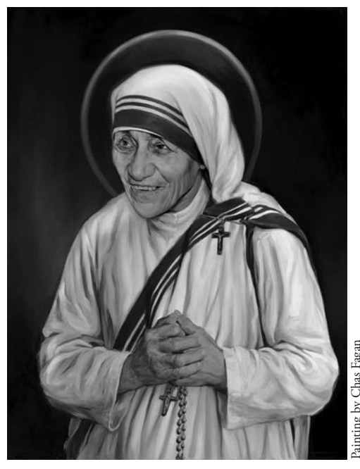
inting by Chas Fagan