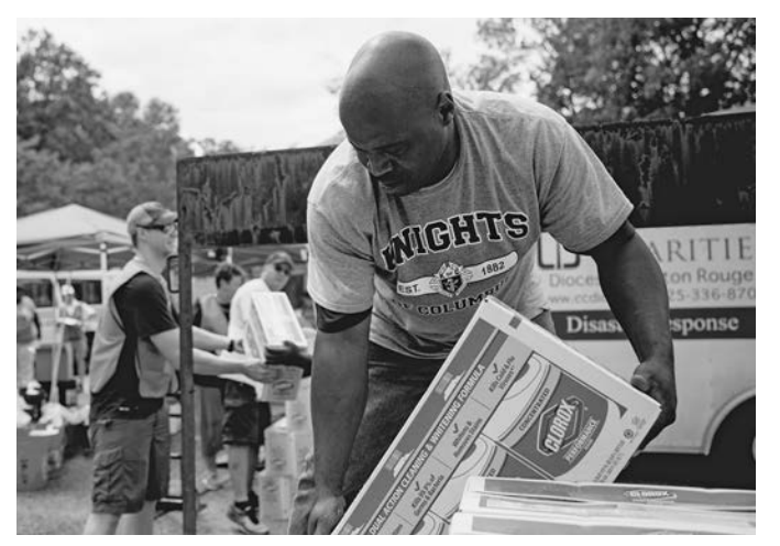
A Knights of Columbus volunteer carries a box of supplies to aid recovery and cleanup efforts, Baton Rouge, La.

The Knights of Columbus has a long history of lending a helping hand in times of distress.