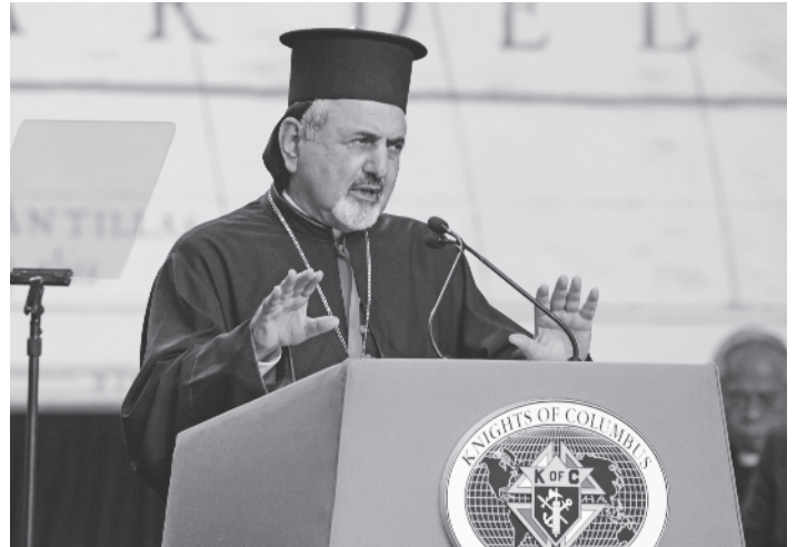
Beatitude Ignatius Joseph III Younan, patriarch of the Syriac Catholic Church of Antioch, presents religious freedom as the basis for human rights advocacy and the survival of Christians in the Middle East.

For information on what your council can do to further support these Christians, visit christiansatrisk.org .