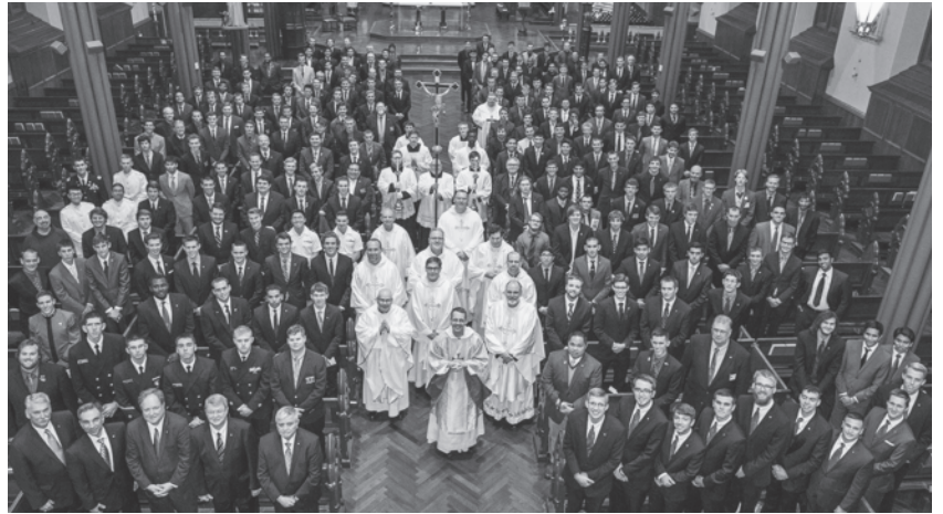
College Knights gather for a Mass celebrated at St. Mary's Church during the 2015 conference. The event marked the 50th anniversary of the College Councils Conference.

Any questions regarding the conference should be directed to the College Councils Department at college@kofc.org or 203-752-4671.