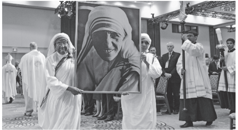
The portrait of Blessed Teresa of Calcutta is processed into the ballroom for the memorial Mass during the Knights of Columbus' 134th annual convention.