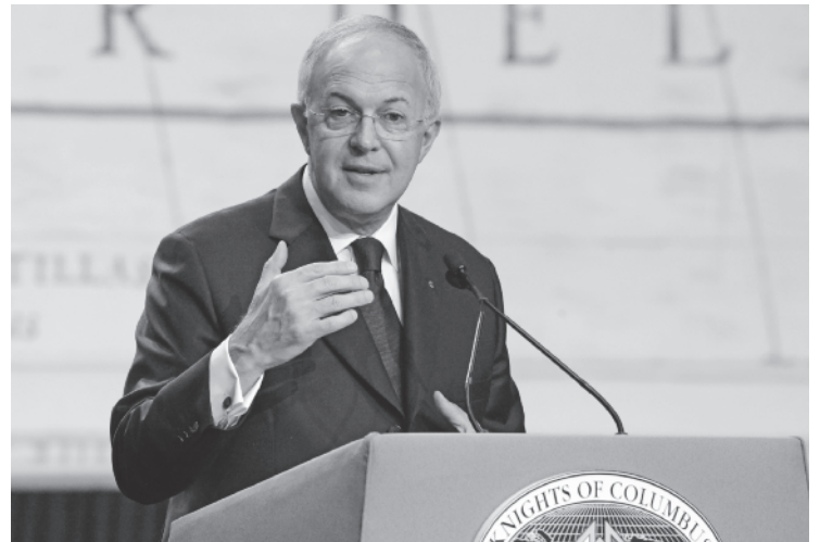
Supreme Knight Carl Anderson addresses the closing business session during the 134th annual Knights of Columbus Supreme Convention, Toronto, Aug. 2.