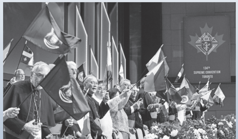
The guests at the dais stand and wave their flags during the annual States Dinner.