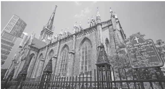
St. Michael's Cathedral, the cathedral church of the Roman Catholic Archdiocese of Toronto and one of the oldest churches in the city. It is located in Toronto's Garden District, just blocks away from where the 134th convention was held.

Each year, information on the convention's preparation, the Chaplains Meeting, the States Dinner and the Supreme Knight's Address are posted daily on kofc.org. Featuring news briefs, photos and links to both live and archived video, the webpage is your premier source for inside coverage — both during and after the event.