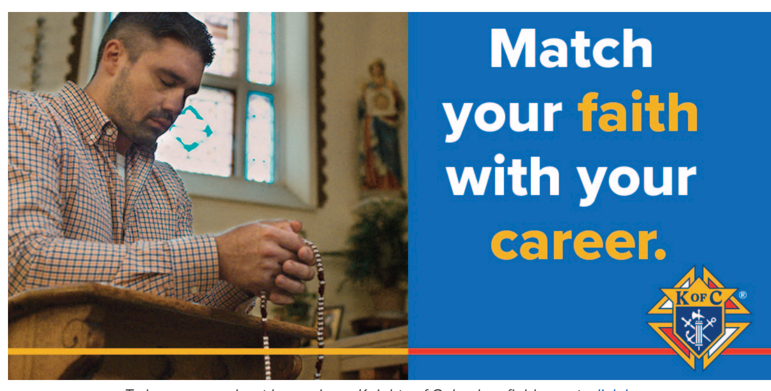
To learn more about becoming a Knights of Columbus field agent, click here.