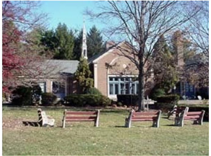
Our Lady's Hall