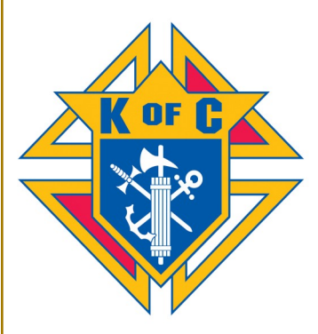
In Service to One. In Service to All

Knights of Co1umbus 180 S. Russell Ave Aurora, IL 60506