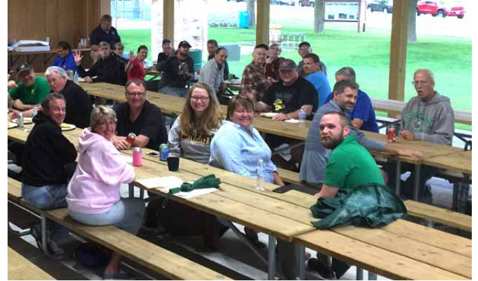
A large crowd of KC members and family members enjoyed the food and commradarie at the picnic.