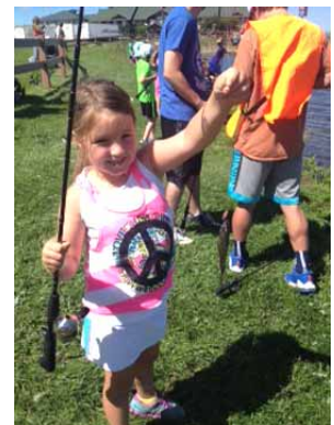
A happy little fisherwoman displaying her catch.