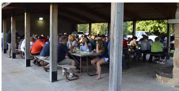
A large number of hungry KCs turned out for the wonderful picnic.