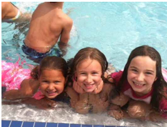
These three young ladies enjoyed being in the pool.

This year's Altar Server Party was held at River Springs Water Park on Tuesday, August 5. The servers were treated to free admission, two slices of pizza, and a drink. There were 40 attendees from three parishes. Sacred Heart, St. Joseph and Holy Trinity.