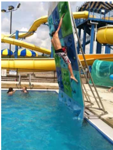
This young man enjoyed climbing one of the walls at the waterpark.