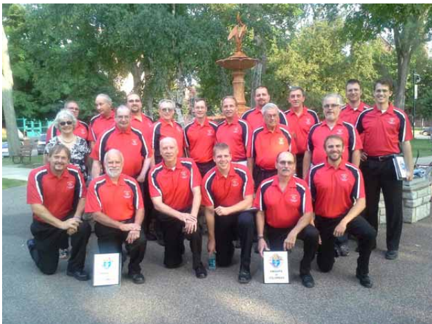
KC Chorus performed in Central Park in the new red shirts supplied by the Assembly and Council 945.