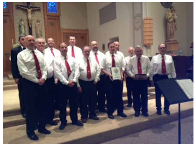
KC Chorus performed at Litomysl Summer Festival.