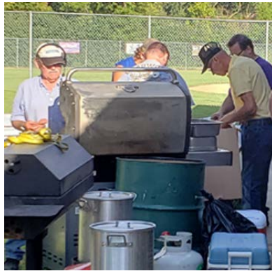
Grillers getting the food ready.