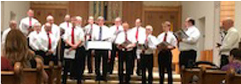
The KC Chorus sang beautifully at the Festival.