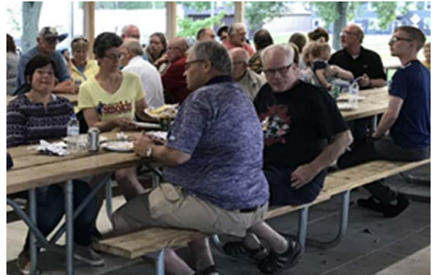
A large turnout for the picnic.