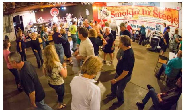
Dancing at the Beer Garden.

Keep in mind the dates for SMOKIN' IN STEELE 2014 are May 30 - June 1, 2014!