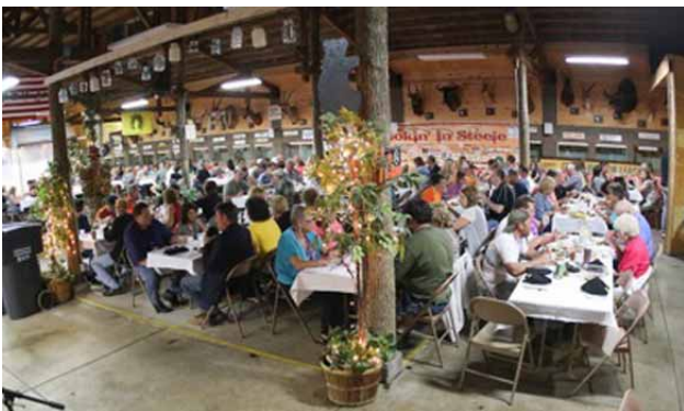
VIP sponsors dinner