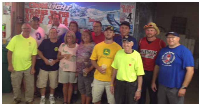
The grandstand beverage crew take a break for a photo op.