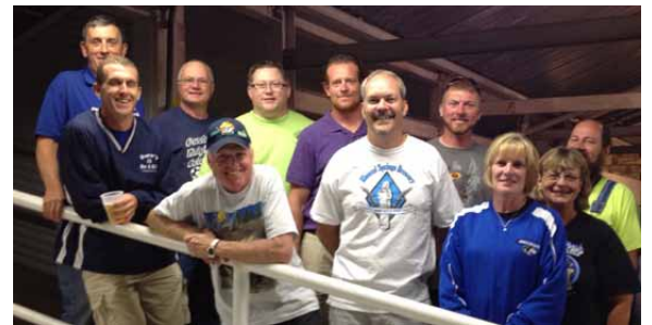
KC Knights, family, and friends work at the grandstand.

All proceeds from the food stand and grandstand beverage sales go toward KC charitable projects.