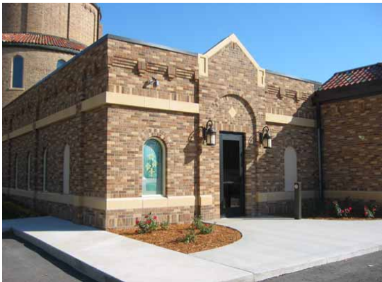
Catholic Community Adoration Chapel of the Most Holy Cross.