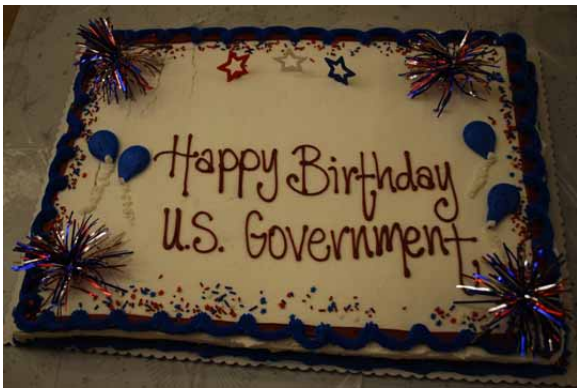
Delicious dessert for the Constitution Day party.