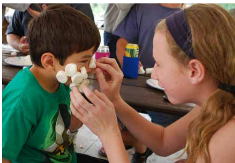
Children enjoying fun and games at the family picnic.