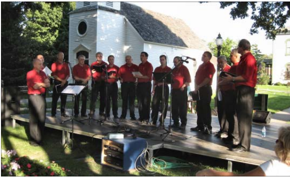
KC Chorus at the Village of the Yesteryear prior to program.

The KC Chorus was honored to make two appearances at the 2010 Steele County Fair. The KC Chorus participated in the Fair opening flag raising ceremony at Fair Square on Tuesday afternoon, August 17. The KC Chorus sang patriotic selections for 20 minutes and then sang the National Anthem during the flag raising ceremony by military personnel. Fair opening attendees appreciated the music, especially the Armed Forces Salute .