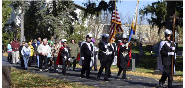
A nice group of participants follow the honor guard at the cemetery.