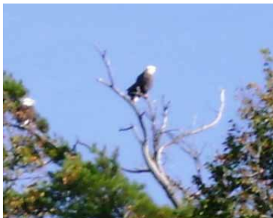
A bald eagle welcomed the fishermen to four fun-filled days of fishing.

The KC fishing trip to Cut Foot Sioux (connected to Lake Winnibigoshish) went quite well. Thirty-two fellows, mostly from Owatonna, ventured north September 27 for a four-day trip. A warm south wind felt good, bringing the temperature to 80 degrees when we arrived. It's tough to do; fall fishing in those conditions. A few crappies were caught that first day - just not good weather for walleyes. The wind turned from the north and blew in some cooler temps Sunday afternoon. A couple walleyes and more crappies showed up in the fish cleaning house. The Windsor chops served to the group were mighty tasty. Otto Lehrer even came over to visit and do a little crappie fishing with us. Monday was fish contest day - and the weather wanted to put us to the test. With the wind 'howling' out the east and northeast, the fish were all but lock-jawed. However, by the end of the day, a number of respectable fish were entered. Biggest fish included: walleye, 23-1/2"; northern, 30"; and crappie, 13-1/2". The trees were about 50% in fall colors - and the eagles were providing good shows of flying prowess. The quick temperature change (highs about 50 Monday & Tuesday) put the fish down and made catching a pretty good challenge. All in all, however, the trip was enjoyable and most are planning to return again next year.