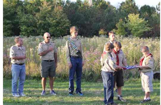
KC sponsored Boy Scout Troop 253 fold the first flag to be burned in the retirement ceremony.