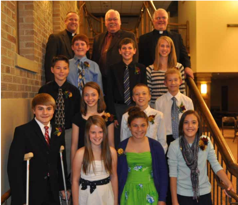
Seventh graders from St. Joseph Parish, Sacred Heart Parish, Holy Trinity Parish, and Christ the King Parish.