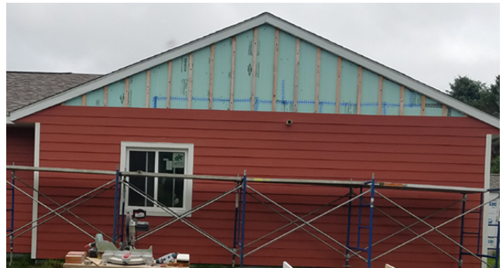
Habitat house in Claremont, Minnesota.