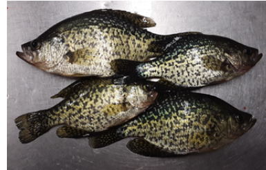
9" to 10" crappies