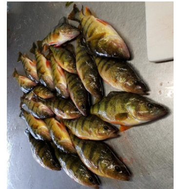
10" to 12" perch