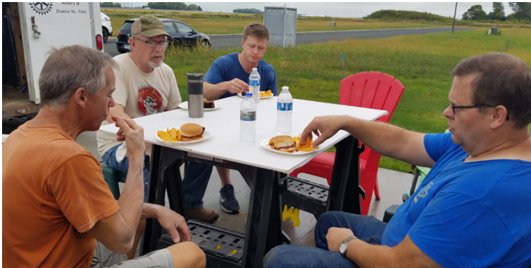
Knights of Columbus volunteers stop to have a little lunch.