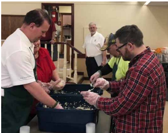
Putting the finishing touches on the meal at the last KC Fish Dinner.