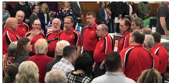
KC Chorus sing the National Anthem at the Night of Knights Auction on April 13 at St. Mary's School.