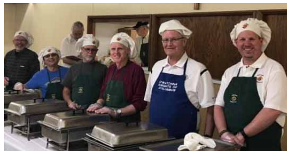
A group of KC members waiting for customers at the last fish dinner of the season.