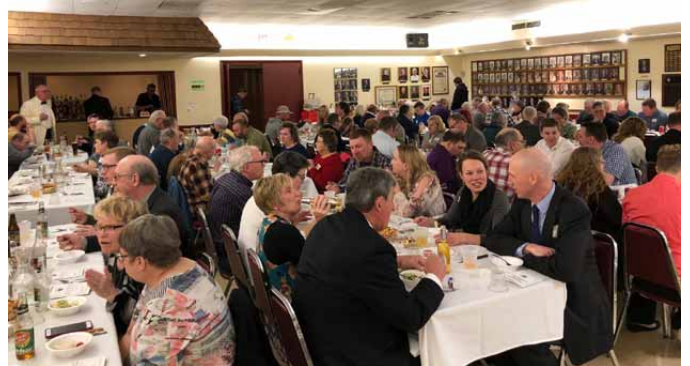
There was a large turnout for the wonderful meal, awards, and outstanding speaker.