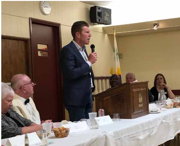
Keynote Speaker Matt Birk gives a very inspirational speech.