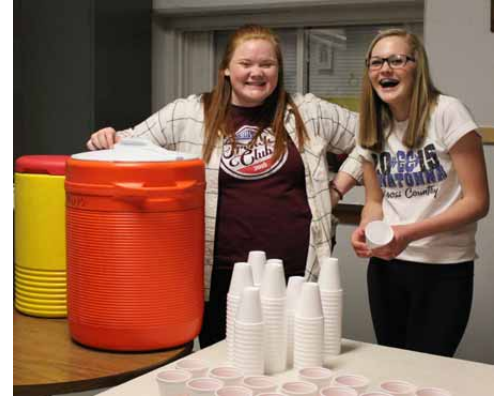
Two smiling workers ready to serve beverages.