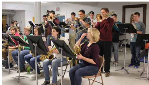
Jazz Band performing.