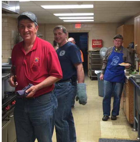
Kitchen crew getting ready for the large crowd.