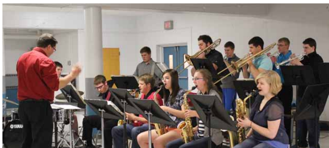
OHS Marching/Jazz Band performs for the dinner.

The Owatonna Knights of Columbus Council 945 sponsored their annual Spaghetti dinner for Owatonna area Boy Scouts and Cub Scouts, OHS Cultural Club, OHS Close-up, OHS Robotics Club, and the OHS Marching/Jazz Band on Tuesday, April 14th at St. Mary's School Cafeteria with the Jazz band playing to the audience. This year was the largest in participation, meals served, and volunteer hours provided. Over 425 meals were served and 59 volunteers helped with all aspects of the event. The spaghetti dinner raised approximately $1,250.00 that went directly back to the youth organizations. We recorded 161 hours of volunteer time. A huge "Thank You" to all those who took the time to help.