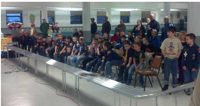
Cub Scouts participating in the annual Pinewood Derby.

At a recent meeting, $300 was contributed to Council 945 sponsored Cub Scout Pack 354 of St. Mary's School. Now, all Cub Scout Packs in Owatonna have a new all-aluminum race track that is fully automated. The system keeps track of times, speeds, and placement of racers. The track replaces an old wooden track that was built many years ago. Pack 354 is our main feeder Pack of Council 945 sponsored Scout Troop 253.