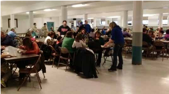
The dining room at St. Mary's School was busy with patrons enjoying the spaghetti featuring the secret KC recipe sauce.