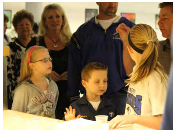
Hungry patrons line up for the first batch of delicious spaghetti to be served up.