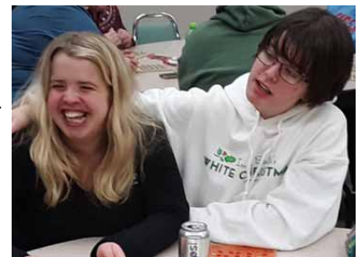
Happy faces of some of the bingo participants.