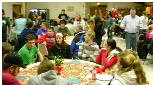
The near capacity crowd at Senior Place enjoy a rousing game of bingo.