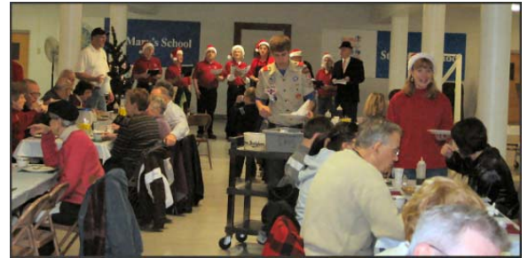
The colorful dining room was busy all morning with families enjoying fellowship, food, music, and Santa.

Make plans now for St. Mary's REP & CYO breakfast on January 10.