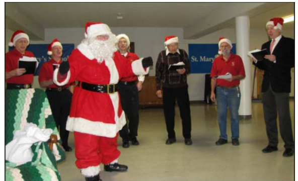
Santa took a short break from his visiting duties to sing and dance with the KC Chorus.