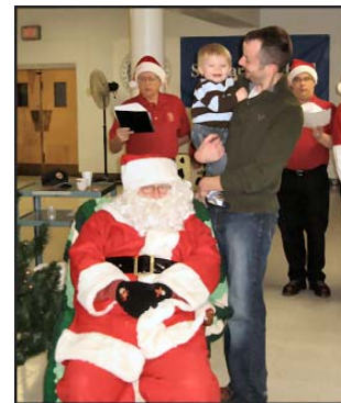
There were many great family pictures with Santa.