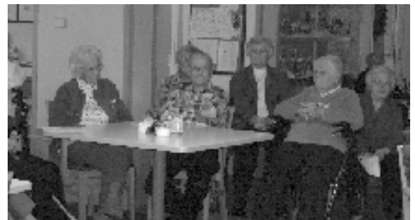
Residents of Park Place, Cedar View, Infinia, Morehouse Place enjoyed the carols by the KC Chorus.