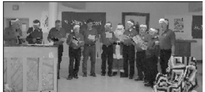
Santa took a short break from his visiting duties to sing and dance with the KC Chorus.