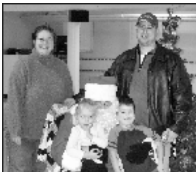
Many parents brought cameras and got great pictures of their children with Santa.