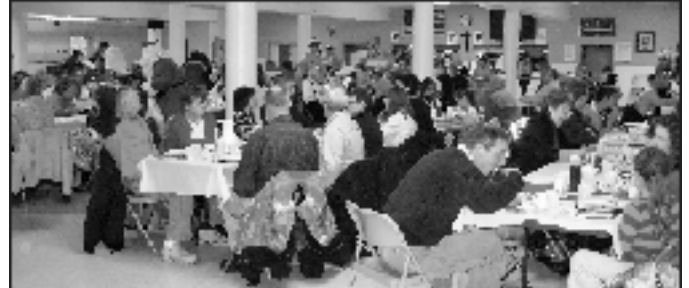
The colorful dining room was busy all morning with families enjoying fellowship, food, music, and Santa.

Make plans now for St. Mary's REP & CYO breakfast on January 11.