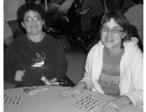
A couple of happy bingo players.