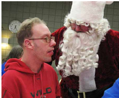
Santa brought joy to one of the visitors.