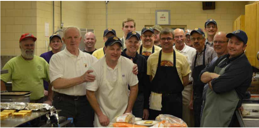
The whole Sunday morning breakfast crew takes time out for a photo op.

The Special Olympics breakfast held on January 13 at St. Mary's School was well attended and we had great help with the dining room tasks, especially the Special Olympics athletes. Thanks to our dedicated breakfast patrons for the good attendance.