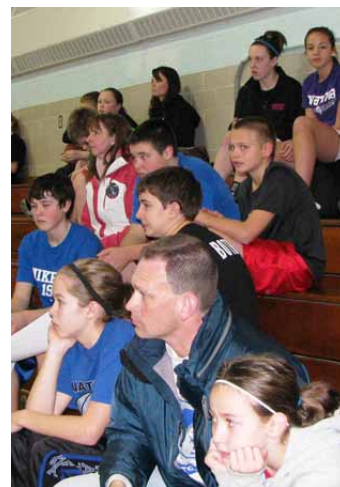
Parents, friends, and other competitors watch as each shooter takes their turn.