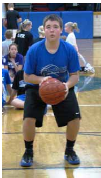
A free throw contest competitor concentrates on his next shot.