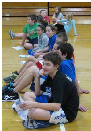
Competitors anxiously await the results of the free throw contest.

Owatonna Knights of Columbus Council 945 held their annual Free Throw Championship on Monday, January 9th. The winners in the various divisions were as follows: