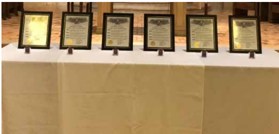
Resolutions of Respect were displayed in the sanctuary.

Following the Mass a time of fellowship was held with Brother Knights and family members of the deceased Brothers in Joseph Hall.